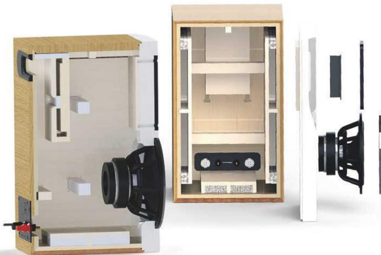
ABOVE: Renderings from the side, front and exploded baffle reveal the lightly braced Helmholtz cavities employed to both control resonances and modify the port output at the cabinet rear

small sound, not much bass', you're on the wrong track. I'll admit that I expected some allowances would be needed for the diminutive KIMs on their slender stands. That was, until heard on the end of PM's Melco/dCS Vivaldi One/Constellation Inspiration Mono reference system [ HFN Jun '17/Feb '18/Oct '19], where they proceeded to do a very good job of thumping my chest and rumbling the sofa, while at the same time casting a coherent 'free of the speakers' sonic picture.