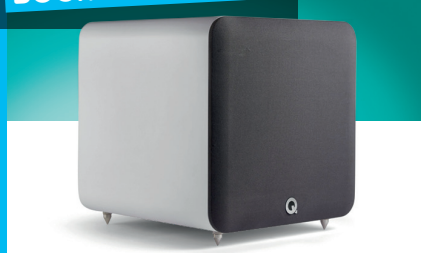
Q Acoustics' Q SUB100 active subwoofer