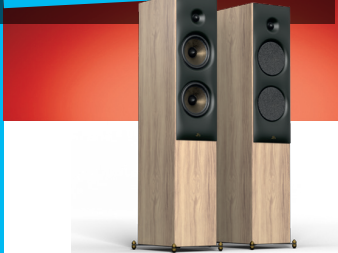
Revival Audio's Sprint 4 2.5-way floorstander